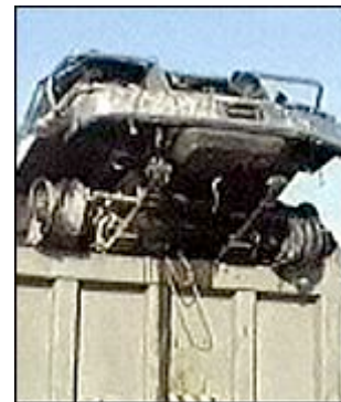
The wrecked jeep was taken away for inspection